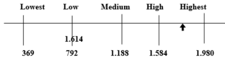
Table. 3 Tabulation of Employee Performance Variable Item Correlation (Y)