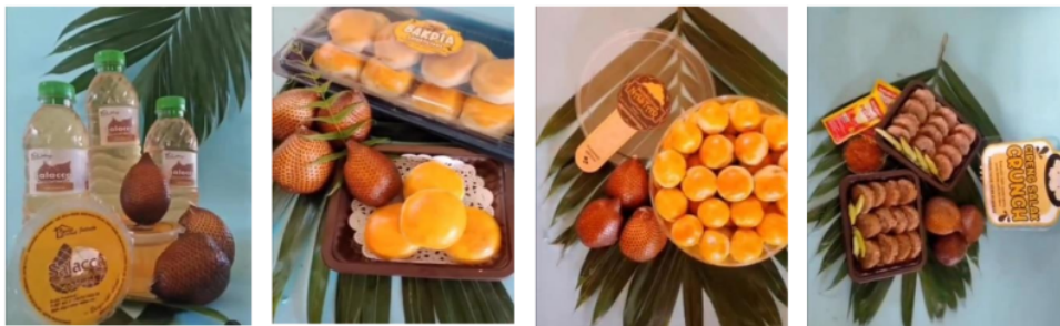
Picture. Examples of product photos processed by participants for social media content

The training provided provides knowledge to participants about the elements needed to determine the final selling price, such as various burden costs, cost price, selling price and financial percentages. Apart from that, participants can also understand the stages in determining the selling price and predict when they will experience the sales break-even point or what is often called BEP (Break event Point). Participants who can determine the BEP indicate that the participant can predict how much and for how long the participant will sell their product.