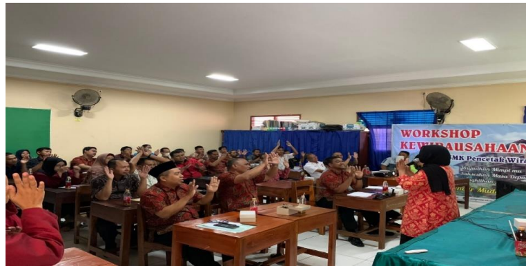
Figure 3. Understanding about Learning Media

After the participants were given an understanding as depicted above, they immediately did their first practice in following tips for recording and creating learning media in the form of interesting videos for learning using a mobile phone. In this practice, only one mobile phone connected to the internet network was needed. Then, the teachers and staff could directly create learning media according to the explanation and instructions from the resource person according to their creativity as depicted in the image below: