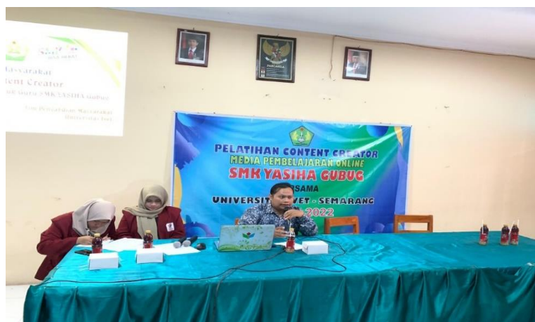
Figure 5. Delivery of Tips for Recording Videos from a Mobile Phone

After the teachers and staff finished their practice, they were given broader knowledge and understanding about how to create a YouTube channel and how to upload the videos they have made to their own YouTube channels. This was one of the most interesting parts of the training that the teachers and staff felt. The entire series of activities of community service was concluded with a discussion and emphasis on the importance of utilizing the most interesting learning media, providing a new learning atmosphere to encourage students to have the ability and willingness to learn, especially for students in the SMK Yasiha Gubug environment who still need learning according to the purpose of SMK, which is learning that leads to the world of work and industry. At the end of the activity, the participants were given a questionnaire to find out their response to the community service activity.