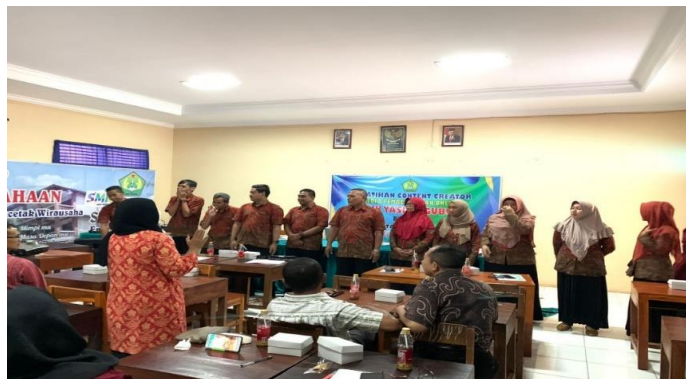
Figure 4. Delivery of Material on Recording Tips from a Mobile Phone

After the participants were given an understanding as depicted above, they immediately did their first practice in following tips for recording and creating learning media in the form of interesting videos for learning using a mobile phone. In this practice, only one mobile phone connected to the internet network was needed. Then, the teachers and staff could directly create learning media according to the explanation and instructions from the resource person according to their creativity as depicted in the image below: