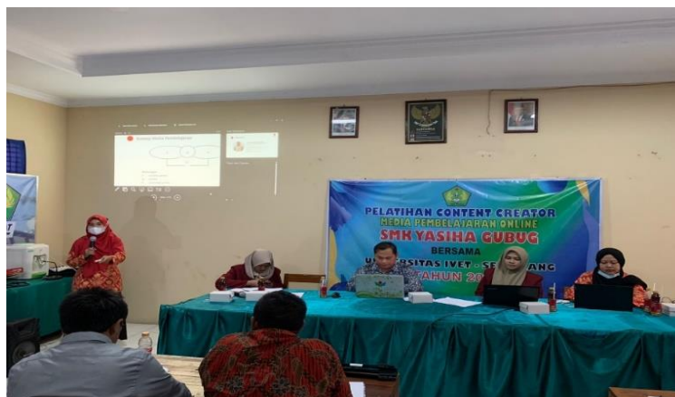
Figure 2. Delivery of Innovation and Learning Media Material

The activity went smoothly and according to plan, the teachers and staff were very enthusiastic about learning to develop creativity and improve their understanding of the importance of learning media in the teaching and learning process. This training activity took place in two stages: the understanding stage and the application stage. The first stage was the understanding stage, where the participants were encouraged to realize how important it is to innovate to improve the quality of teachers and enable them to fully carry out both online and offline learning possible through online learning media.